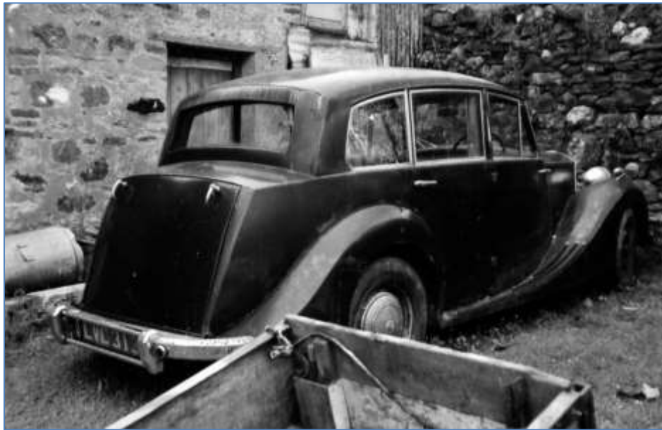
TDC 2017 in Cornwall c1980

Talking of two limousines together, the late Arthur Pocock of Enfield purchased two limousines; 2017 [LVC 313] a jade green example in Cornwall and 2125 [MXF 550] a black car in the West Country. The former was the car I took to show Walter Belgrove as described at the beginning of my story in part one, and the second car was reputed to have been owned by the editor of the Daily Express newspaper. Both cars were in poor condition when purchased.