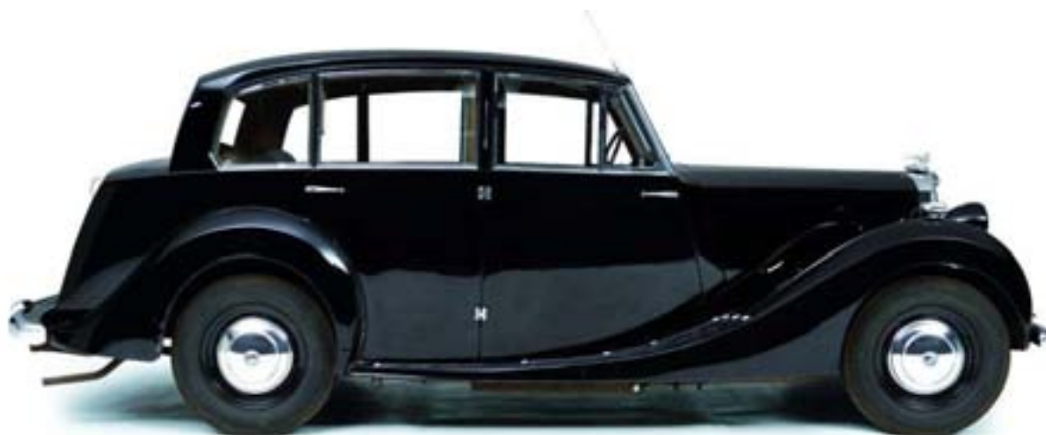
Standard Triumph publicity creation of a limousine with painted headlights.